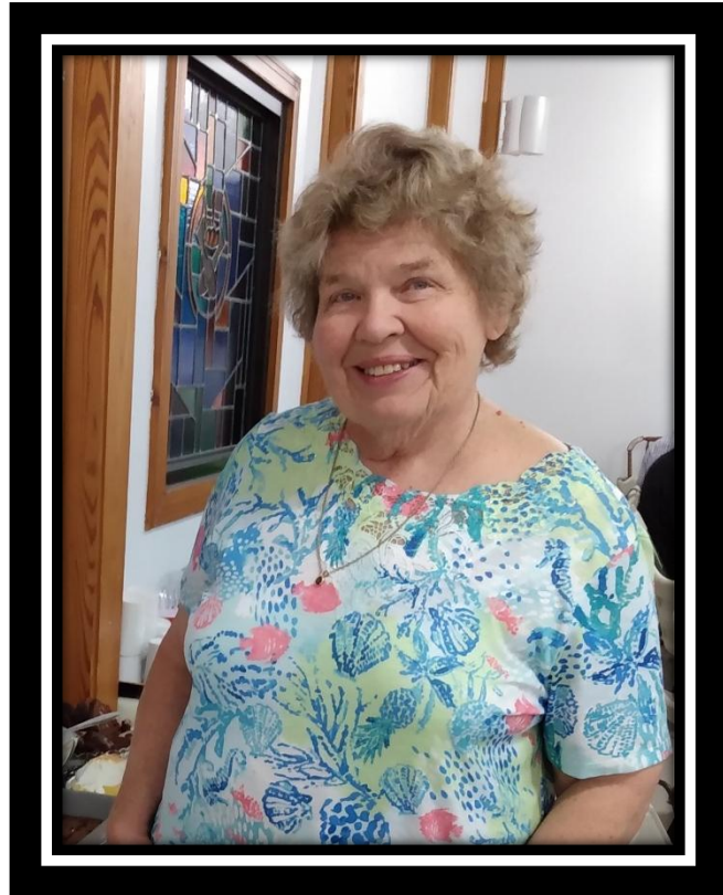
Picture from BLC farewell Aug. 7, 2022

Let us know your special events to include: baptism, retirement, promotion, graduation...